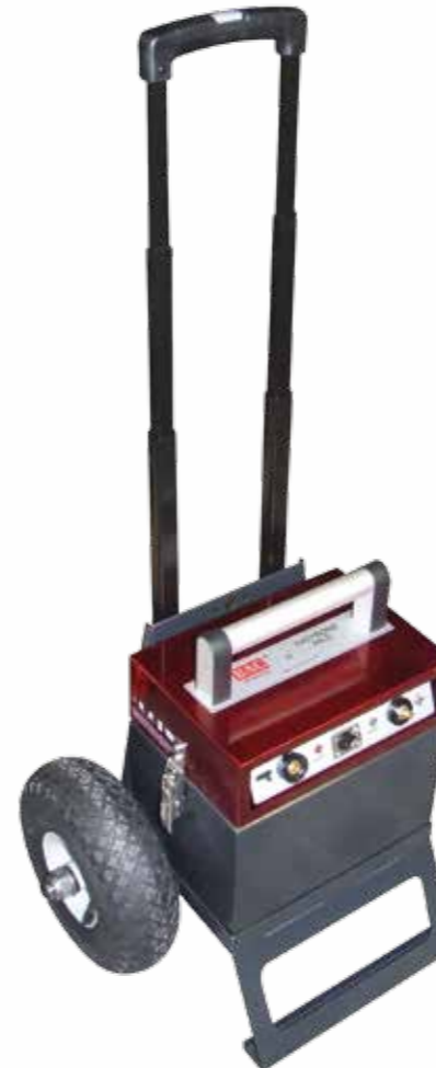
2731004825 Trolley for Power Unit